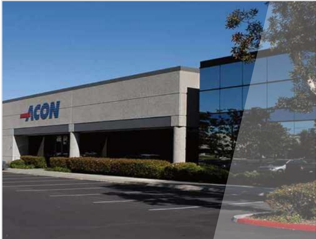
San Diego, California USA

ACON Laboratories, a global, award winning manufacturer with its headquarters in San Diego, has proudly built its reputation in the medical device industry as a strategic partner and OEM manufacturer for some of the largest companies worldwide. At the core of the organization resides the adage, “Your Trusted Partner.” The company’s goal is to make a positive health impact on the millions of people around the world that use its products.