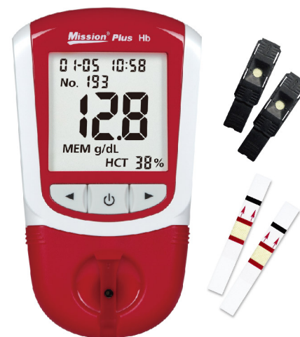
Mission ® Plus Hb Hemoglobin Meter