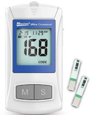
Mission® Ultra Cholesterol Monitoring System